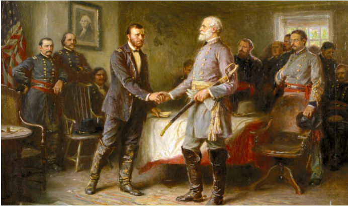
Jean Leon Gerome Ferris, Let Us Have Peace, 1865, c. 1920, reproduction oil on canvas, 23 x 30 inches